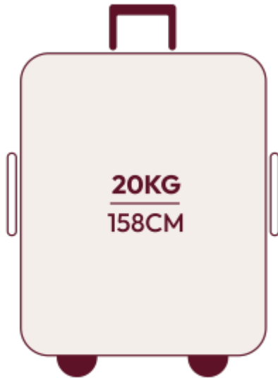
1 x suitcase

As we travel in mini-coaches, luggage space is limited. Here's what you can take with you on tour: