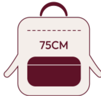
1 x small carry-on bag (backpack or handbag)

If you have more luggage, please make arrangements to store it prior to joining the tour. We are unable to carry extra luggage on the mini-coach.